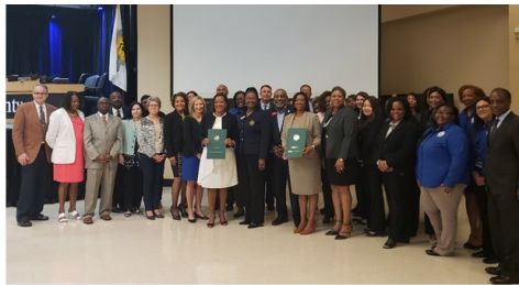
Recognizing April as Child Abuse Awareness Month with DeKalb's CASA, DFACS, and Juvenile Court