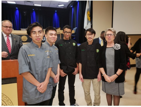
Graduates of culinary arts high school programs