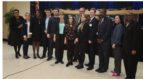
The Friendship Force of Georgia brought a Delegation from Ukraine to observe the BOC for a day