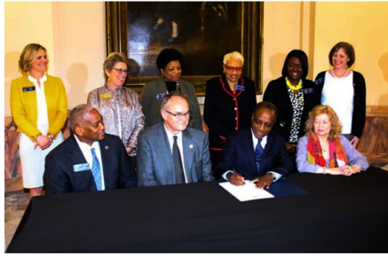
Formal agreement to establish a Charter Review Commission